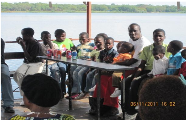
The children on a boat cruise