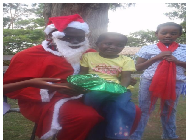
Children were blessed with Christmas presents