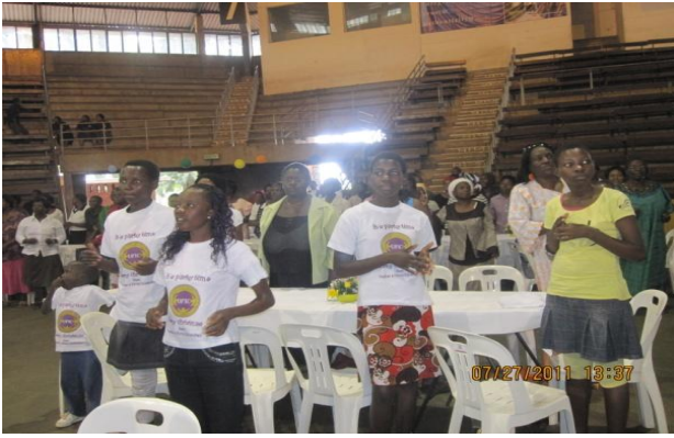
Children enjoying praise and worship at UFI