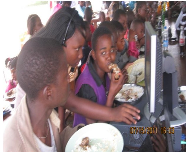
Children enjoying their Christmas party meal