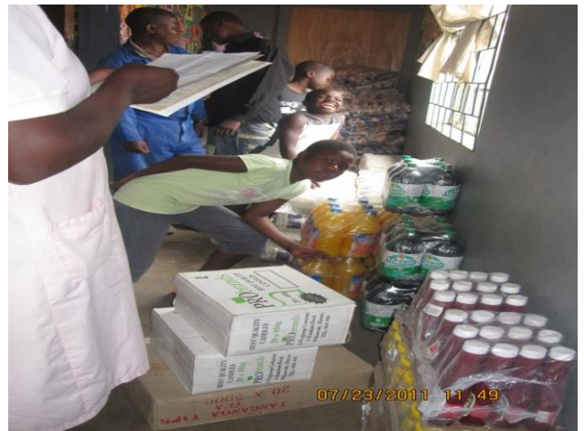
Part of donation from Capernaum Trust