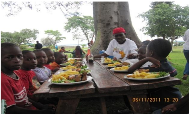
A scrumptious lunch was prepared for the children