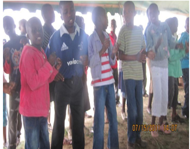
Children entertaining guests at the Christmas Party

The children at Come Unto Me Centre were treated to a Christmas party on the 10 th of December. We thank God for our friends in Karoi and the surrounding areas for their amazing support. When we planned for the party the organisation had no resources to host the party. We appealed to the community of Karoi and we are so thankful that they responded in such an amazing way and we were overwhelmed by their love. The children enjoyed an overflow of blessings and there was plenty of food for them and our guests at the party. Please see pictures below: