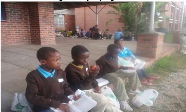
The Children enjoying their Christmas Lunch