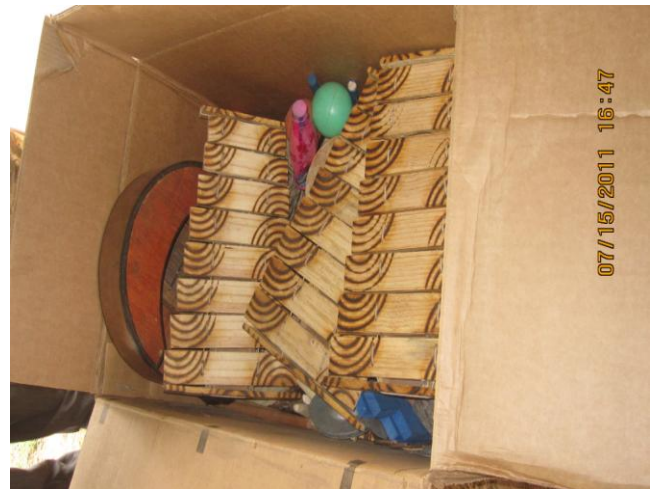
Musical instruments received from Ten Foundation

Ten Foundation donated a box of musical instruments for the children's entertainment. We are sure this will keep the children entertained during their morning devotions and when they are just taking time out to play.