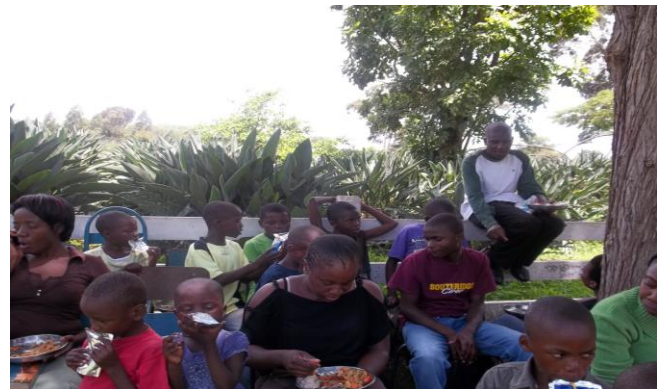
Staff and children enjoying Thai food