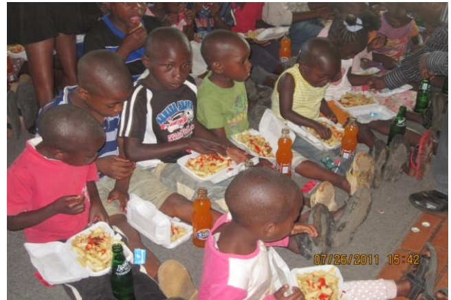
Children enjoying lunch with friends from Innerscity Lunchtime Fellowship

We thank God for our friends from Innerscity Lunchtime Fellowship who treated the children to lunch on the 21 st of December. It was a wonderful day for the children who were being reunited with their friends from Innerscity Lunchtime fellowship after a brief period without meeting. We however thank them for their continued support throughout the year.