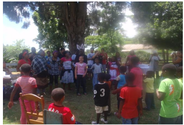
Students from Prestige entertaining the children at Faith and Hope Centre

The children were treated to a Christmas party by Prestige College. It was a day filled with lots of fun and games and also drama by the students. The children had an opportunity to entertain the guests. The children were also presented with lovely Christmas gifts.