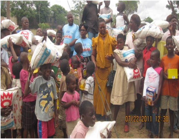
Children and staff receiving donation from TM Karoi