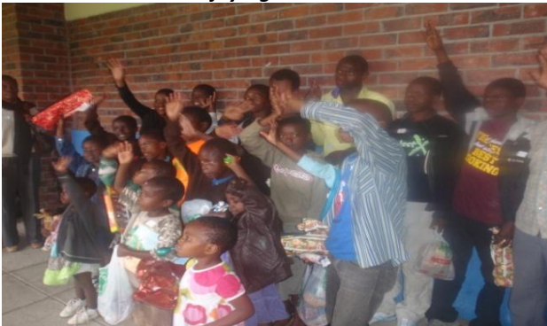
Children with gifts they received from Miracle Missions