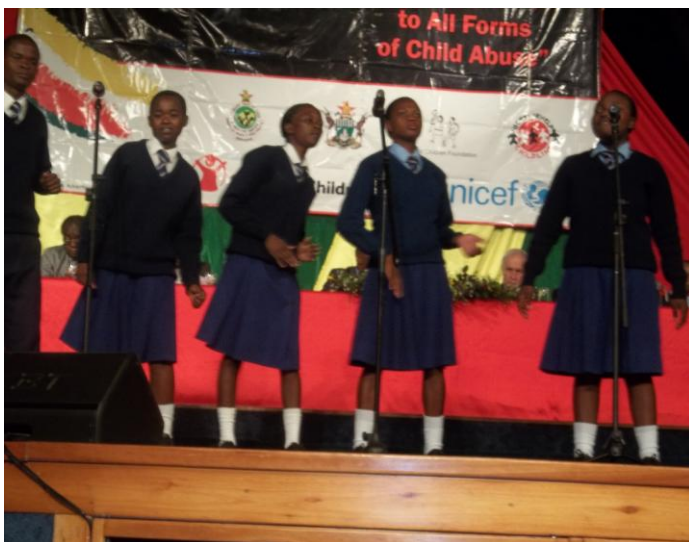
Our children performing at the celebrations