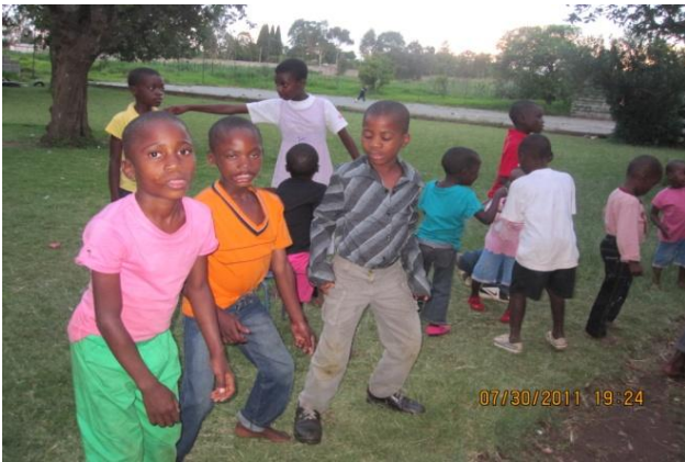
The Children having fun on Christmas Day